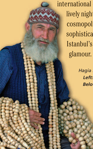
Above: Hagia Sophia, Istanbul Left: Bead merchant Below: Spice market

international cuisine and a lively nightlife add cosmopolitan sophistication to Istanbul's Old World glamour.