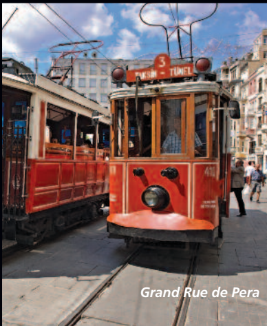
Grand Rue de Pera