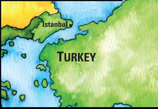
Far left: Dining along the Bosphorus