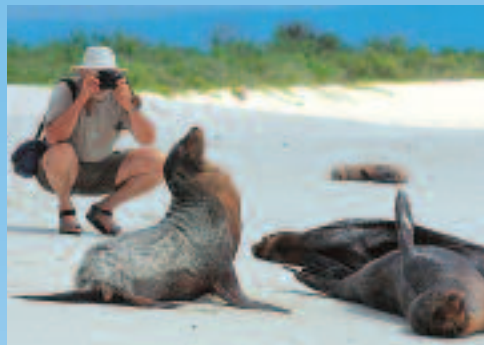
Take the photographs of a lifetime during up-close wildlife encounters in the Galápagos.

Enjoy the scenic beauty of Santiago Island's Buccaneer Cove surrounded by dramatic volcanic cliffs where hundreds of sea birds perch.