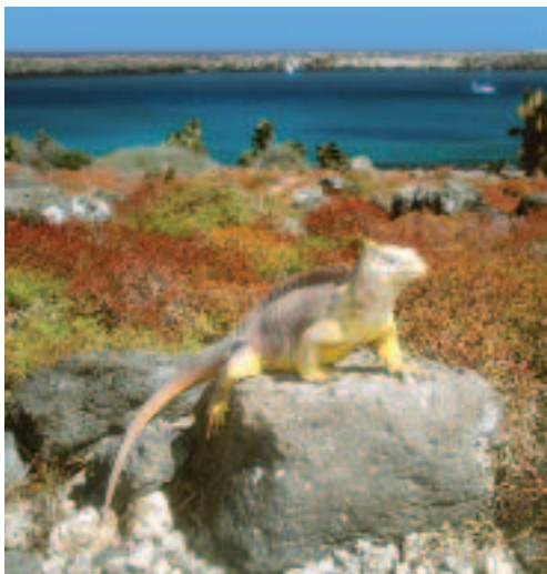
Observe, as Charles Darwin did more than 150 years ago, the distinct creatures indigenous to the Galápagos Islands, like this land iguana.