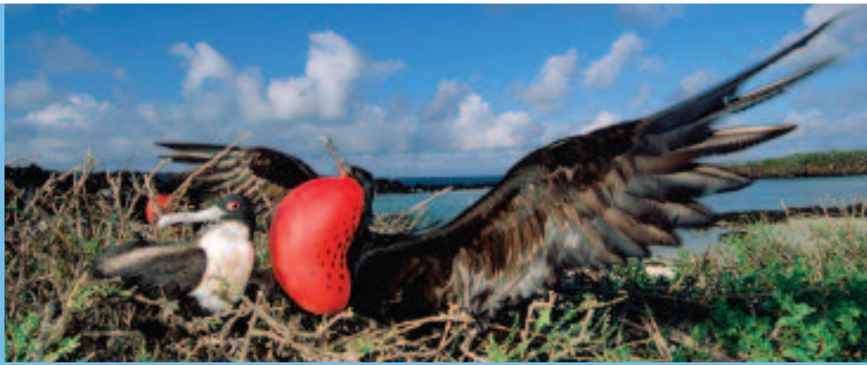
Look for the unusual mating “dance” of the magnificent frigate birds, one of the Galápagos Islands’ hallmark species.

Go ashore for a closer look at wildlife, much like the British pirates, sailors and whalers who used this protected harbor as a safe haven did in the 18 th and 19 th centuries while making repairs and gathering salt, fresh water and firewood.