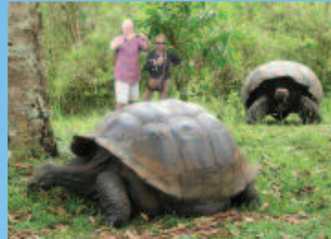
In 1570, the islands were named “galápagos,” meaning tortoise, based on sailors’ descriptions of their inhabitants.

Arrive this morning at San Cristóbal, the first Galápagos island Darwin landed on in 1835, and view the giant tortoises