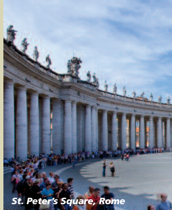
St. Peter's Square, Rome