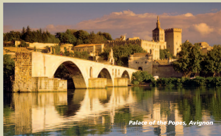
Palace of the Popes, Avignon

Excursion: Victories and Spoils. Butrint is one of the most remarkable archaeological sites in the Adriatic Sea region. In the fifth century B.C., the Greek Chaonian tribe settled here. Later, Roman Emperor Augustus