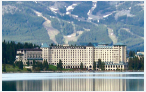
The Fairmont Chateau Lake Louise