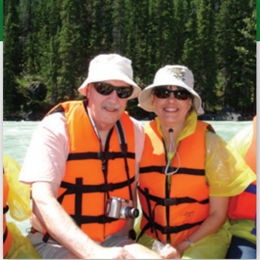
“Wet” your appetite for adventure on a rafting trip