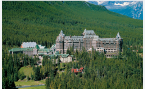
The Fairmont Banff Springs

Park for a two-night stay at The Fairmont Banff Springs, styled after a Scottish baronial castle more than a century ago; the resort’s gracious grandeur is reminiscent of bygone days. Meals BLD