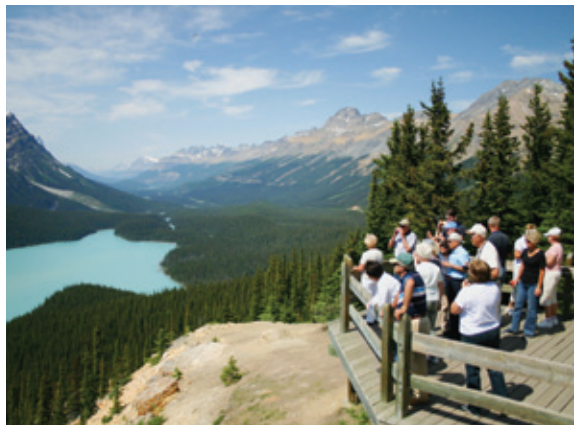
View breathtaking vistas along the Icefields Parkway

Return to Banff National Park, crown jewel of the Rockies , once again along the Icefields Parkway. You’ll enjoy the park’s unspoiled natural beauty from different vantage points today. View mighty Athabasca Falls and the two monumental peaks framing Athabasca Glacier; the famed glacier originates in the Columbia Icefield, whose waters flow into the Atlantic, Pacific and Arctic oceans. It’s a memorable climb up the surface of the glacier aboard a specially designed Ice Explorer vehicle, where you’ll get a good look at the geological features of glaciers as well as learning a bit about their formation. Your vantage point continually changes on the journey. Arrive in Banff National