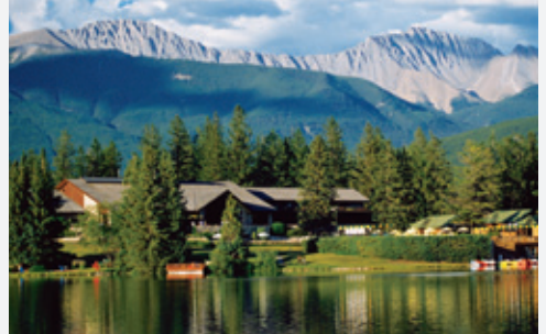
The Fairmont Jasper Park Lodge