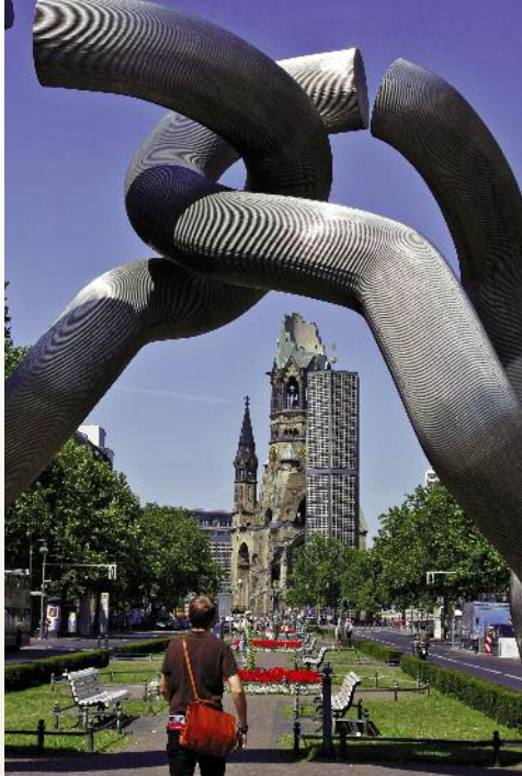
Kaiser Wilhelm Memorial Church

Educational Focus: From Bach to Beethoven — Music