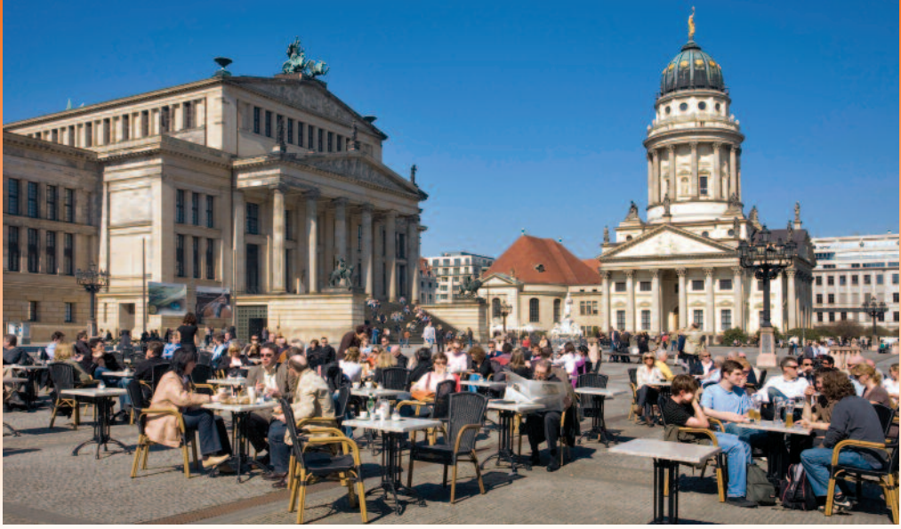
Above: Charming Gendarmenmarkt