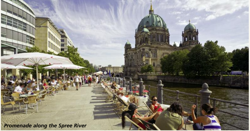
Promenade along the Spree River